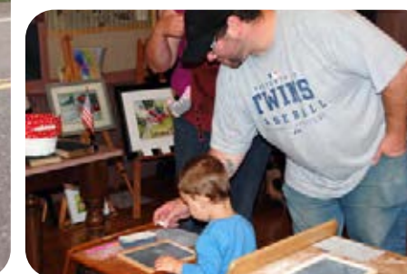
Centennial Weekend, August 23 & 24, 2014