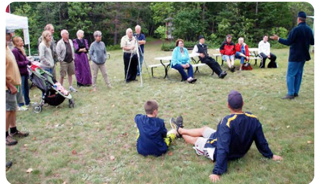
Centennial Weekend, August 23 & 24, 2014