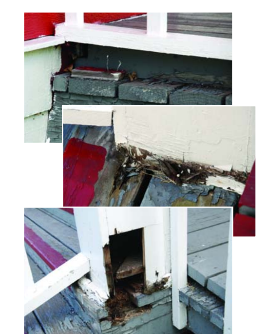
Elements of the existing porch and steps of the Schoolhouse have deteriorated over the years and are being replaced.

The project must be completed for the August 10 Primary Election Day. Painting the